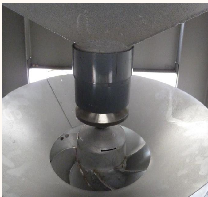
Figure 2: Screw cone for dosing and even distribution to the eight spirals

According to the manufacturer, depending on the raw material, approx. 1 ton of soybeans can be processed per unit every hour. The feed is adjusted by means of a simple screw cone (Fig. 2), which simultaneously distributes the material flow evenly over all eight spirals.