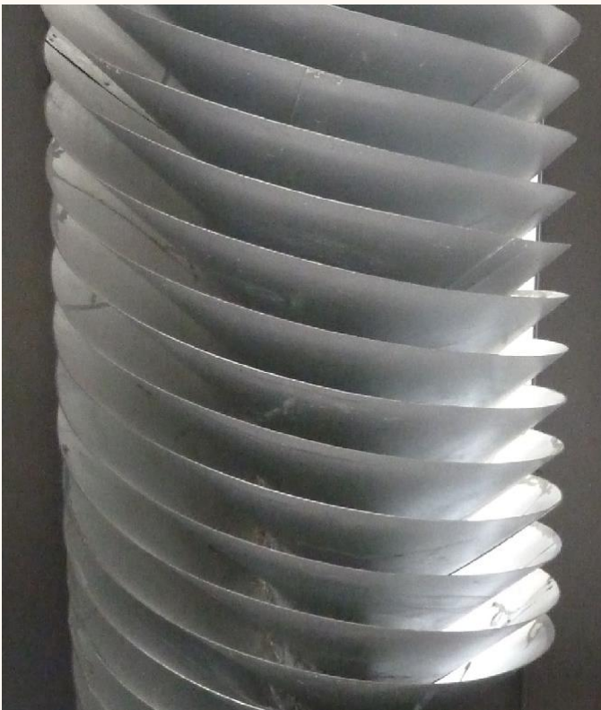
Figure 1: Eightfold soy flight from the manufacturer H&T

In modern spiral separators, several flights are twisted into each other, which considerably increases the efficiency for the same space requirement. For example, in the H&T devices tested by us, one unit contains eight flights (Fig. 1). Sets of up to eight spiral cartridges in one steel cabinet are also available.