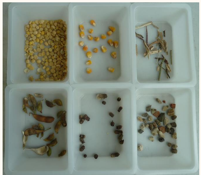
Figure 5: Impurities with which the tests were carried out. The samples come from various Taifun soy deliveries.