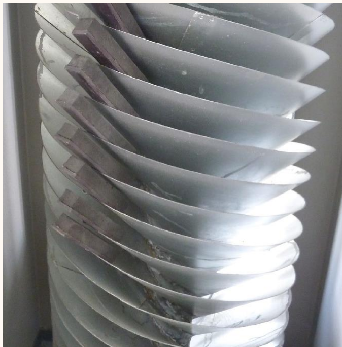
Figure 3: Seed dams for slowing down the crop flow on the same level in all eight flights.

To prevent soybeans and impurities from flying over the edge before they have separated properly, simple magnetic foam strips can be inserted into the spirals at any point (Fig. 3). The material hits the foam, is thereby slowed down and forced to make a further downward turn.